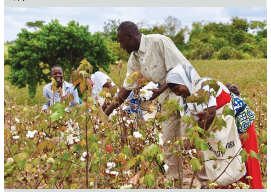
Kenyan cotton farmers being mentored in commercial cotton production, 2017.

New farms are being set up and farmers are being trained and mentored in the production of commercial quality cotton. The cotton is then purchased by the Cotton On Group and exported into its global supply chain improving the sustainability and traceability of their supply chain.