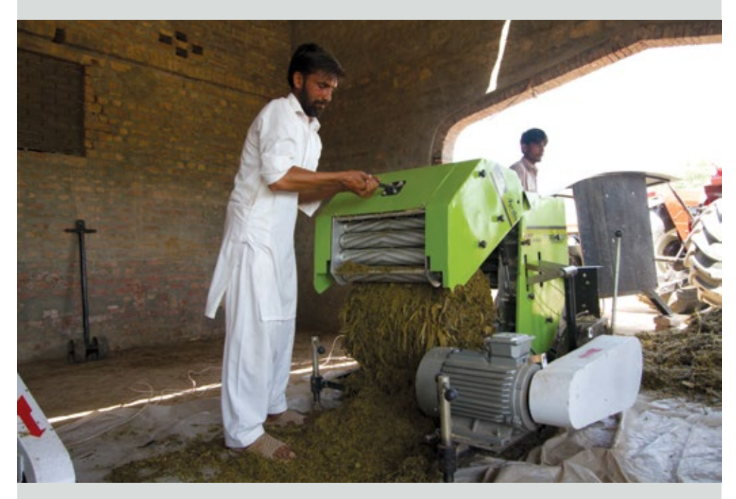
Improving the livelihood of farmers in Pakistan through innovative sustainable farming techniques.

A change is now occurring in the way the dairy sector operates in Pakistan. Businesses are seeing opportunities in servicing smallholder farmers with quality inputs (seed, fodder and vaccines). MDF is exploring new opportunities to further facilitate this pro-poor change including a partnership with finance providers to introduce products designed specifically for female livestock farmers.