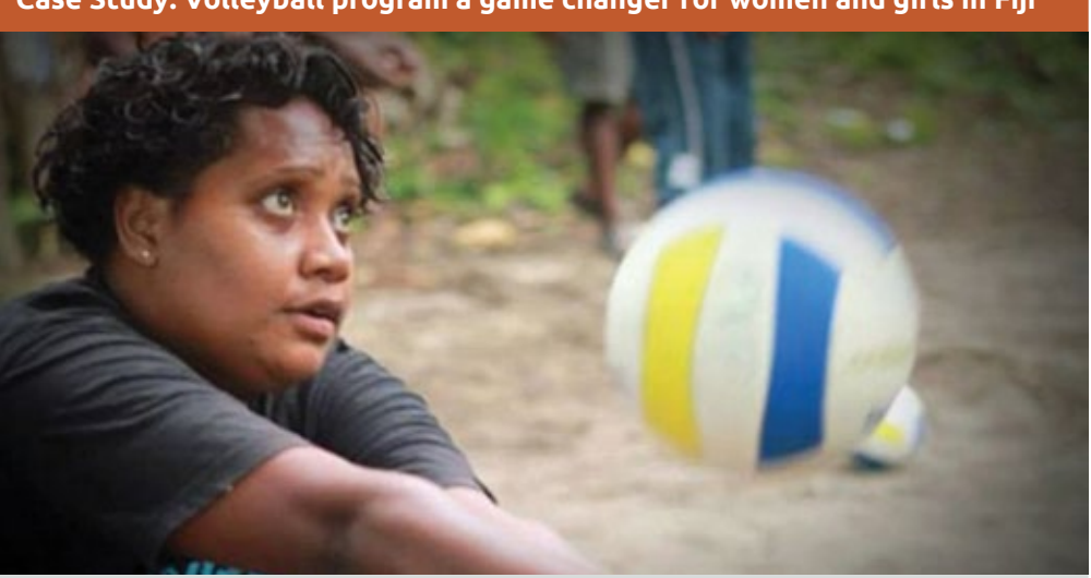
Case Study: Volleyball program a game changer for women and girls in Fiji