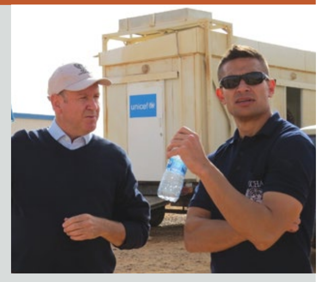
Australian civilian specialist providing assistance to UN Office for the Coordination of Humanitarian Affairs in Jordan.

Over 50,000 people at the berm were cut off from humanitarian assistance in June 2016 when the border was sealed following an attack by Daesh on a Jordanian