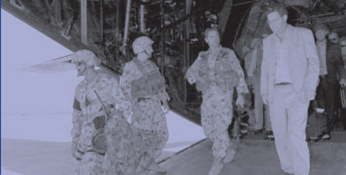
Minister for Foreign Affairs, Mr Alexander Downer, visited Iraq in May 2003 to open the Australian Representative Office in Baghdad.