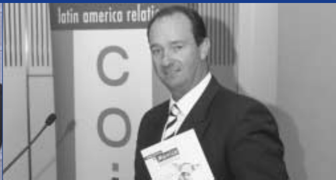
Minister for Trade, Mr Mark Vaile, launched Doing Business in Mexico, produced by the Council on Australia Latin America Relations in December 2002.