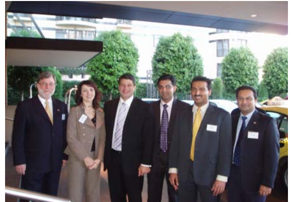
AIBC Victoria Management Committee members with Premier Hon Steve Bracks MP