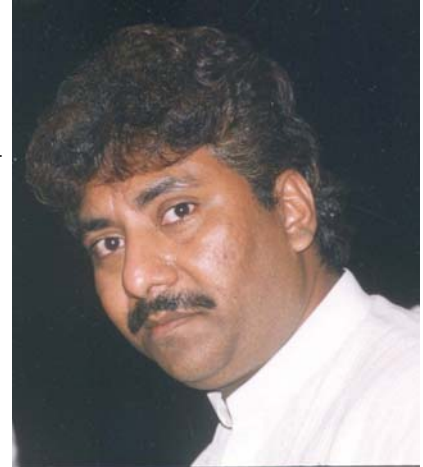
Indian classical singer Ustad Rashid

Mr Khan has developed over the years from a child prodigy to respected maestro. He is known for his extraordinary control over melody and rhythm. His performances usually end with a ' taraana ' by audience demand (a very difficult form of rare virtuoso singing). Rashid Khan has been a Scholar Musician at the prestigious ITC Sangreer Research Academy in Kolkata for a number of years.