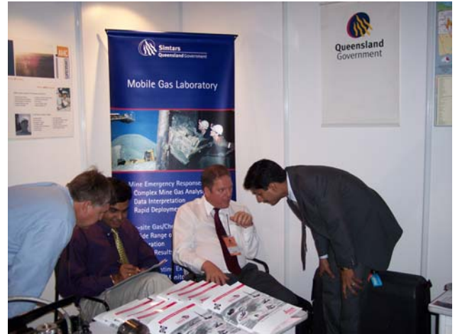
Mining equipment and services representatives at the International Mining and Machinery Exhibition

BlueScope Steel is also currently engaged in a feasibility study with Tata Steel – one of Asia's leading steel companies – exploring the possibility of forming a joint venture to develop a metal coating and paint factory in India. The study is expected to be concluded by May 2005.