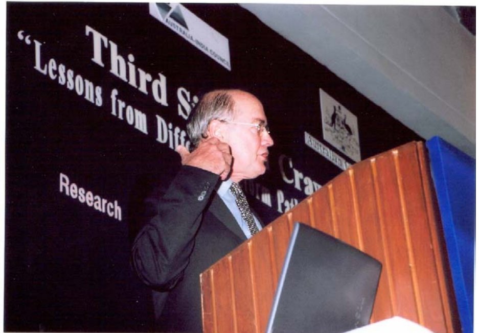
Professor Ross Garnaut AO delivers the third Sir John Crawford lecture in New Delhi on 28 September, on the theme “India, China and Australia: Lessons from Different Paths in Economic Reform”

For a full copy of Professor Garnaut’s address please contact the AIC on ausindia.council@dfat.gov.au